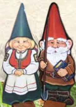
The Hoversten's Nisses - traditional Norwegian gnomes —page 3